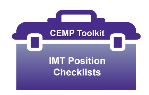
Table 5: Incident Management Team - Facility Position Crosswalk

<u>Table 5</u> outlines suggested facility positions to fill each of the Incident Management Team positions. The most appropriate individual given the event/incident may fill different roles as needed.